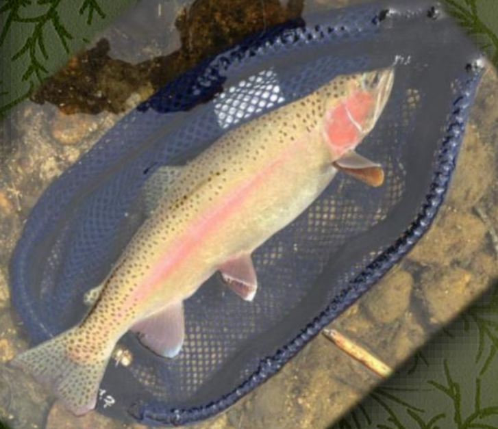
Lower King's Canyon Beauty!