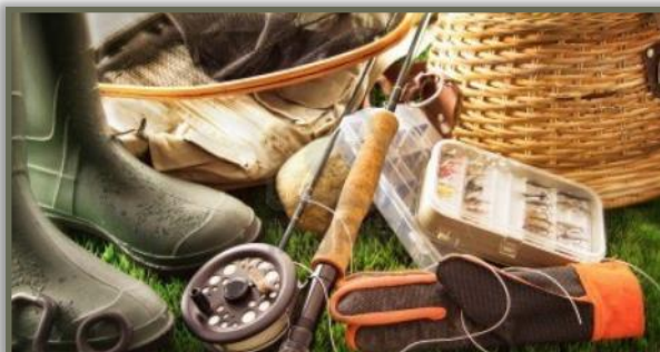
Sierra Classica Fly Rods by ROK

http://www.fishpo.com/fishing-profile.php?id=3064