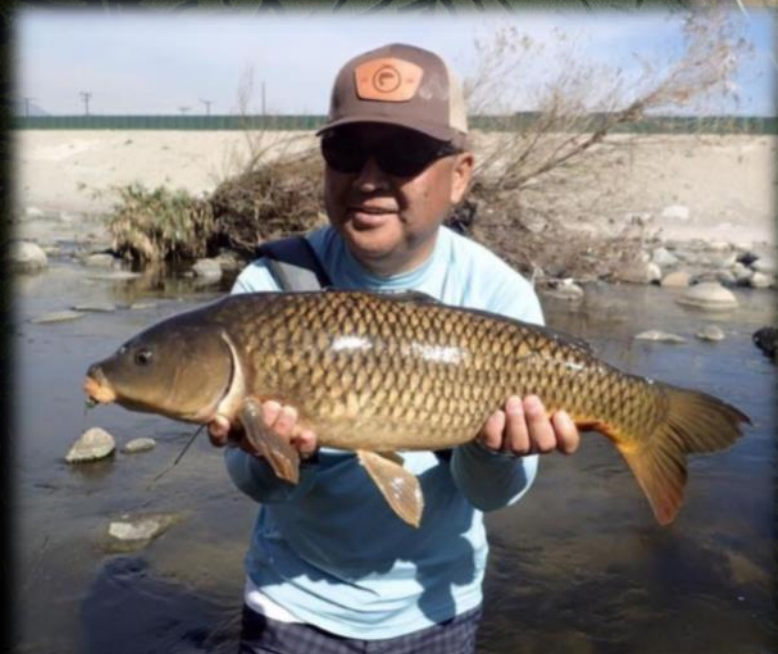
LA Carp Fishing!